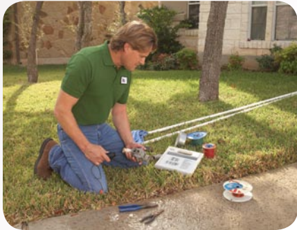
Take your F5 with you no matter where your work takes you.

No longer do you have to sacrifice size and weight for outstanding performance. Weighing approximately 3 pounds with an integrated handle, this ergonomic tool is ideally suited to complement your demanding work day. The Motion F5 Tablet PC offers true mobility with Intel® Centrino® mobile technology and optional integrated wireless broadband technology.