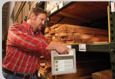
Scan items and even place an order in advance so it is ready when you check out.