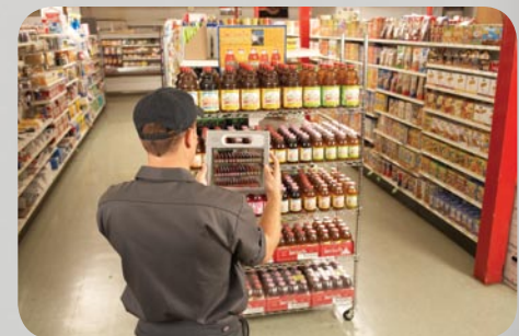
Show proof of work with the integrated point-and-shoot camera.