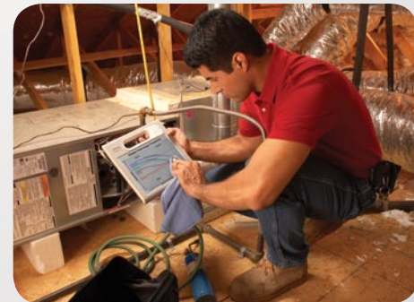
Easily clean the durable F5 while working in harsh environments.