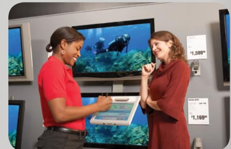
Access product information wirelessly to better serve your customers.

For more information and localized websites, please visit www.MotionComputing.com .